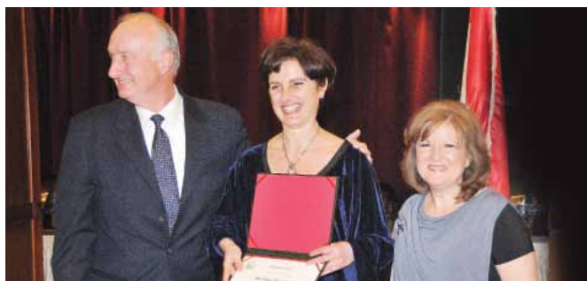
The Edmond Tohme Award