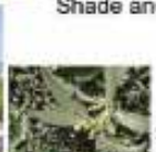
3- Olive Harvest olives