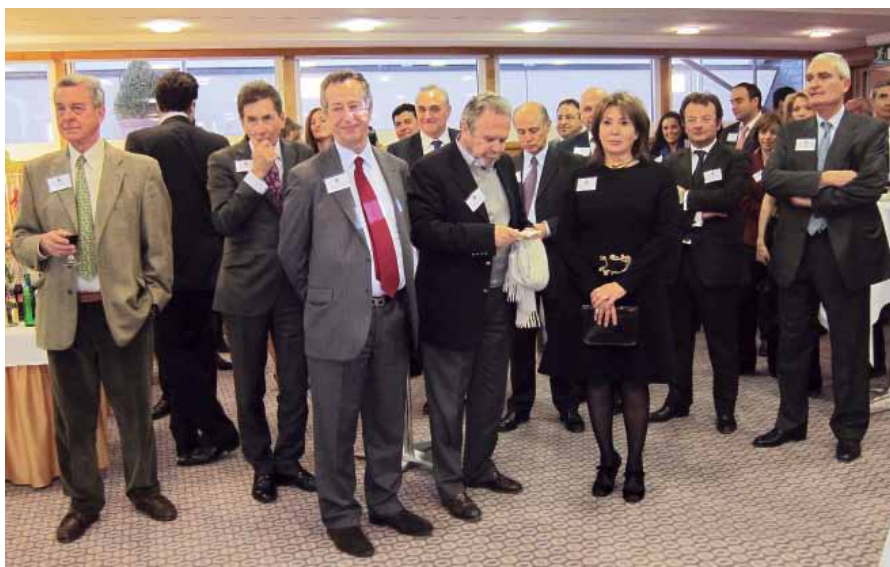
Alumni reception in Switzerland