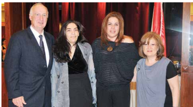
The Randa Khoury Award