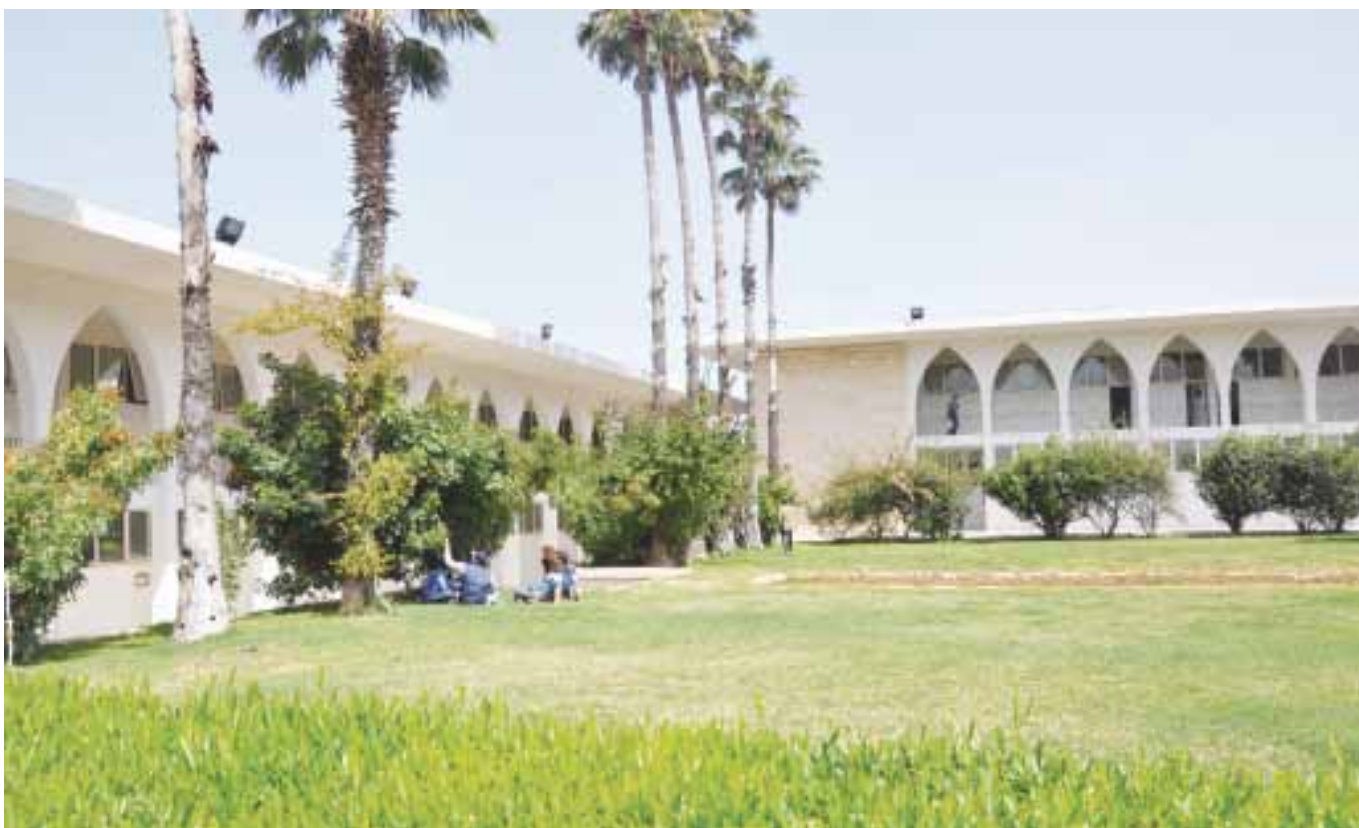
The Meshref Campus was completely renovated and is now the Hariri Canadian University. The architecture and the landscaping was so well planned that administrators kept the buildings and campus exactly as they were.