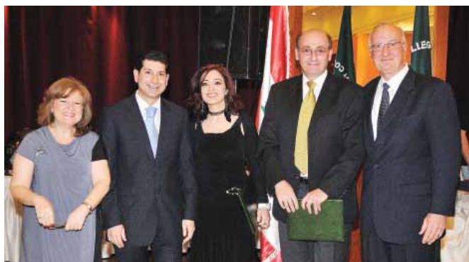
The George Debbas Award