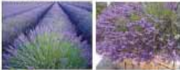
5- Lavender Highly scented Shrub Medicinal Plant