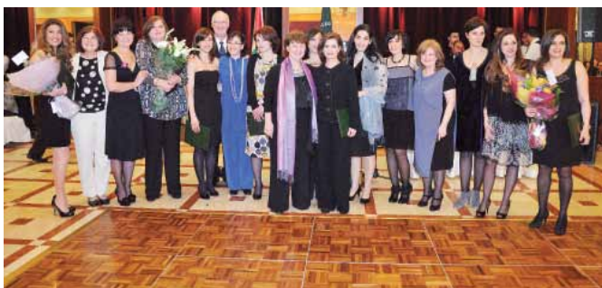
The Albert Abela Award