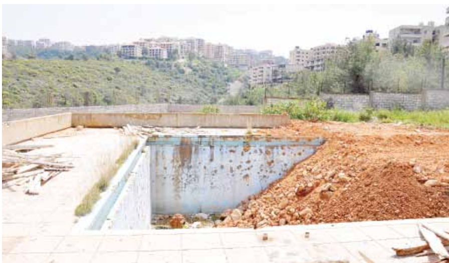
The only remnant of the Bchamoun Campus. The area is currently a construction site for a development project.

But eventually, even they had to abandon the school as militias moved in, looted the school and occupied the premises.