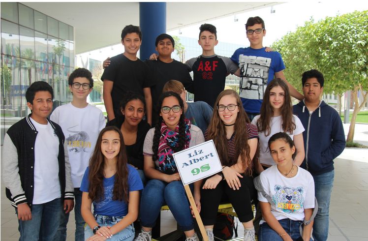
A group of Grade 9 students at the American International School - Riyadh who participated in the compassion campaign. Below, a few notes.