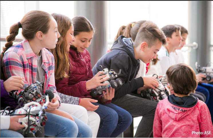
The American School Foundation (ASF) in Mexico has earned official recognition as a Common Sense District for its work on digital citizenship.