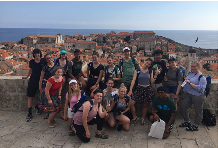
TASIS Leadership Academy students in Dubrovnik.