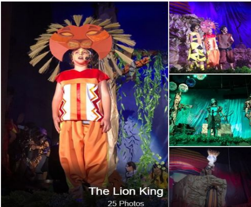
The Lion King 25 Photos

Ras Beirut's Elementary Drama Club presents to the IC community The Lion King musical production.