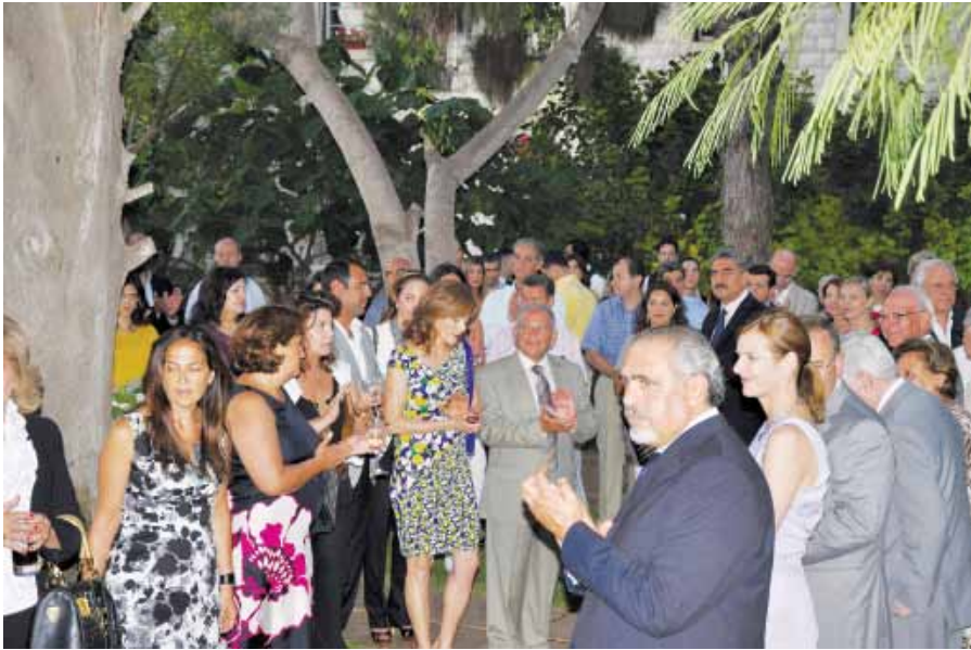
Donor Reception June 2010